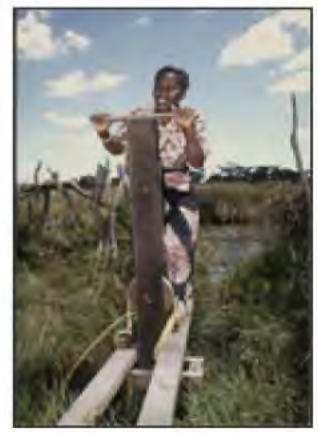
A woman works a treadle pump to irrigate crops. The Technical Cooperation Programme gives support to

For the biennium 2010-2011, the total budget available to the TCP for the implementation of projects is US$ 106.6 million.