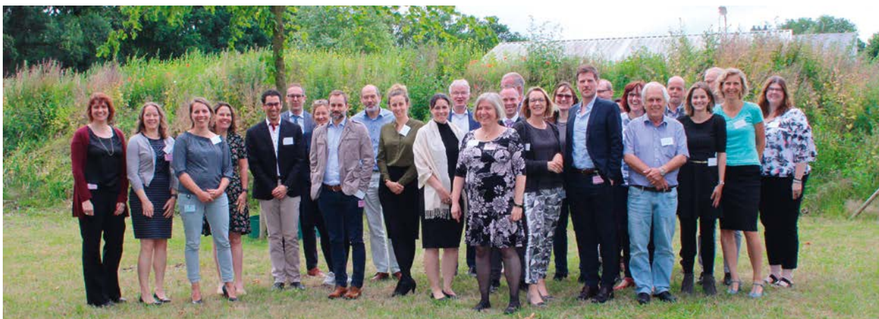
Experts attending the joint BfR and RIVM workshop in Bilthoven

https://www.rivm.nl/en/Documents_and_publications/Common_and_Present/Newsmessages/2018/Animal_free_innovations_in_safety_assessment_of_chemicals