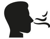
Loss of taste and smell

Does anyone in your household have mild symptoms accompanied by fever or shortness of breath?