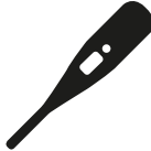
Fever or elevated temperature