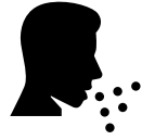
Symptoms of a common cold