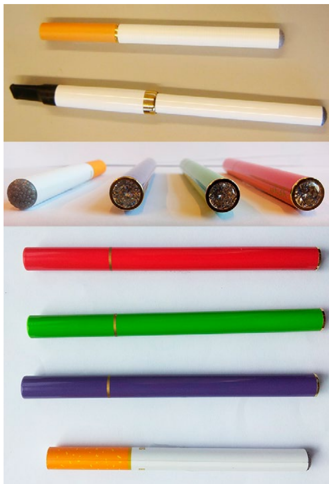
Figure 3: Examples of different types of e-cigarettes

Although e-cigarettes are intended for people over the age of 18,