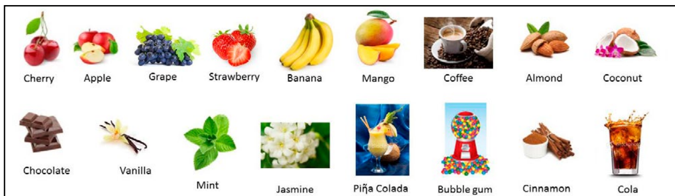
Figure 2. Example of a few e-cigarette flavours

E-cigarettes can be purchased anywhere from small kiosks and stores to online.