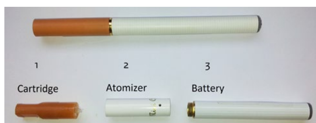
Figure 1: Components of an e-cigarette

pushing a button, while automatic batteries are activated by sucking in air.