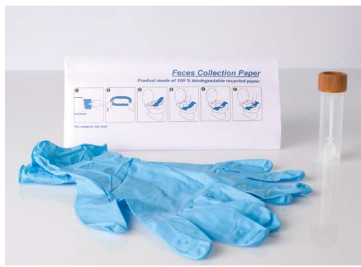
Figure 1: Material that was provided to the participants for collection of stool samples.

Published by National Institute for Public Health and the Environment P.O. Box 1 | 3720 BA Bilthoven The Netherlands www.rivm.nl/en