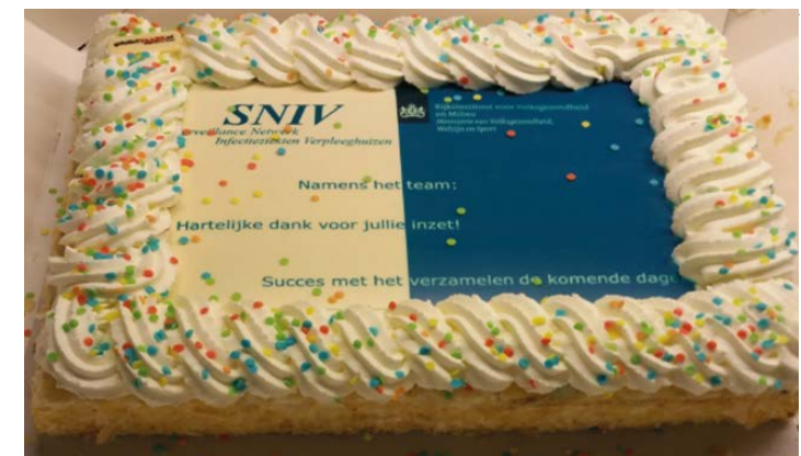
Figure 4: Incentive for participation.